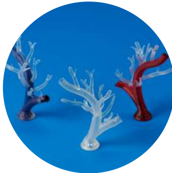
Elastic Resin for Flexible, Translucent 3D Printed Anatomy