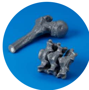
Standard Resins for High-Detail Models

“Formlabs tools are game changing. My Formlabs printer is my first line when I want a rapid, high resolution print. It is in every sense my right-hand printer and resides in my office. The interface allows individuals in my lab to quickly become comfortable with operations and the versatility of the material choices has allowed for tremendous innovation for our group.”