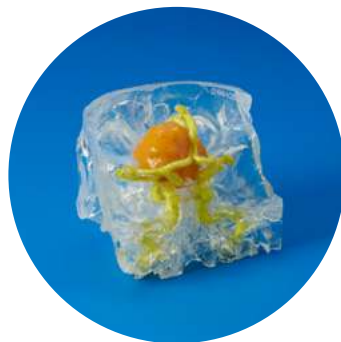
Clear Resin for Rigid, Translucent Models